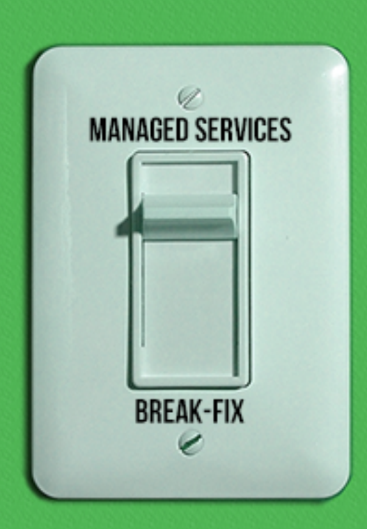
Table of Contents Making the Switch from Break-Fix